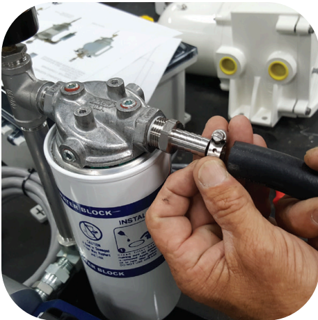
Step 4: Attach the black discharge hose to the fine filter with clamp