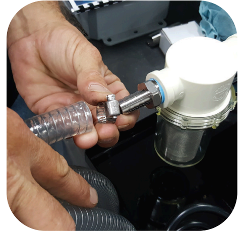
Step 3: Attach the clear suction hose to the strainer with clamp