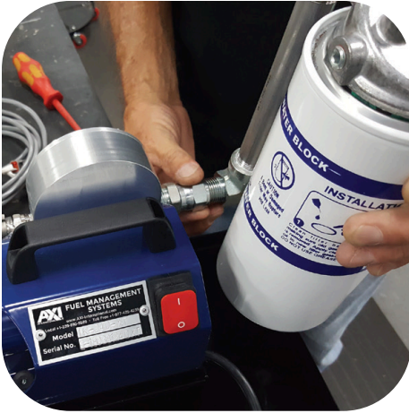
Step 1: Attach the fine filter assembly (male to female connection)

The TK-240 XT is shipping in multiple assembly pieces. Please follow the system assembly instructions below upon receiving the system