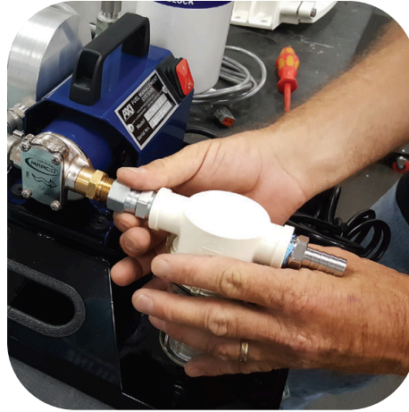
Step 2: Attach the strainer assembly (male to female connection)