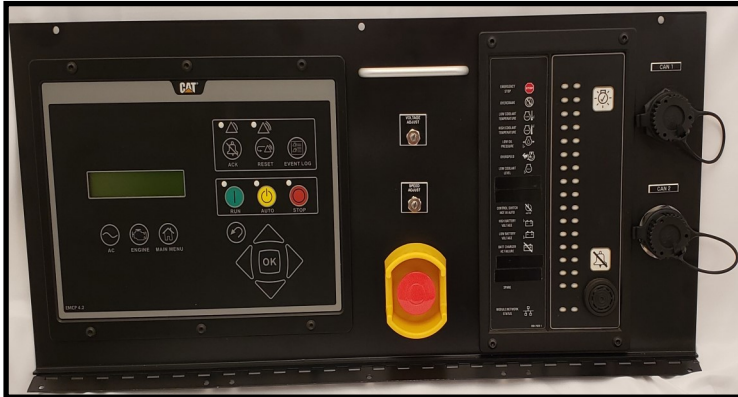
controller & annunciator not included