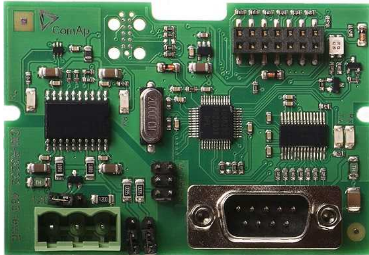
Image 1.1 CM-RS232-485 interface

CM-RS232-485 is optional plug-in card to enable IntelliLite the RS232 and RS485 communication. This is required for computer or MODBUS connection. The CM-RS232-485 is a dual port module with RS232 and RS485 interfaces at independent COM channels. The RS232 is connected to COM1 and RS485 to COM2.